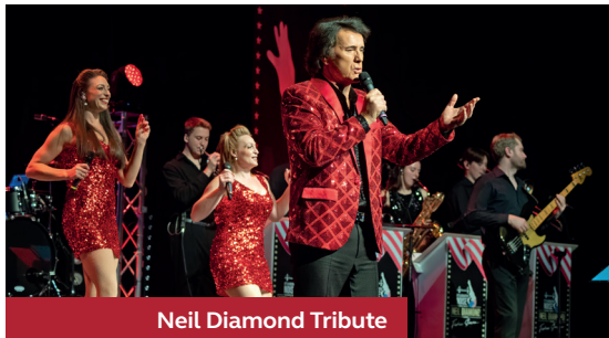
Neil Diamond Tribute