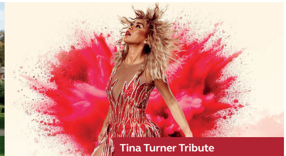
Tina Turner Tribute

Live music plus free access to activities for the whole family: