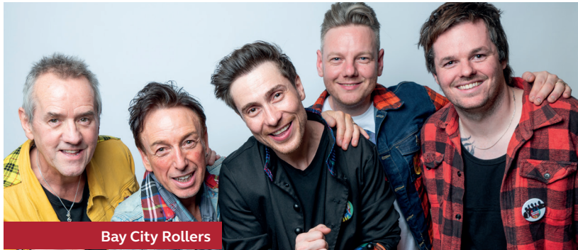
Bay City Rollers