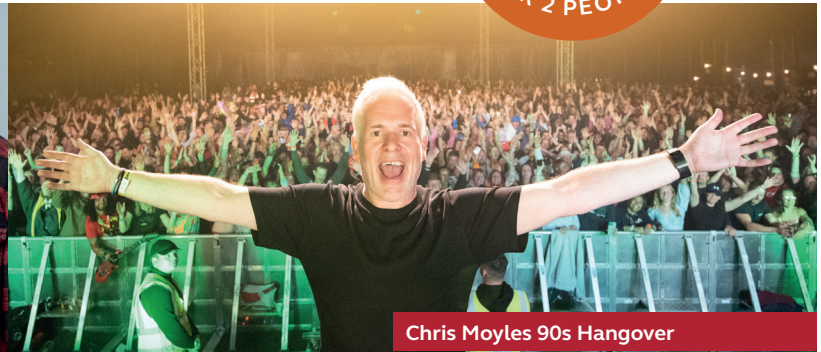
Chris Moyles 90s Hangover